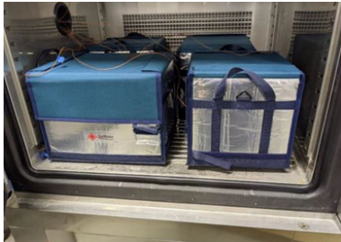
Boxes in test chamber

The standard includes Heat and Cold Profiles developed from data gathered in Real World Transport .